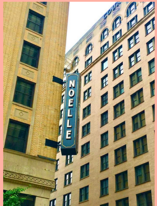
The Noelle Hotel where Audrey, her family, and Maxwell House Hotel residents takes refuge during the fire.

My hope for Count the Nights by Stars is that it will remind us to truly see one another through a lens of love, acceptance, and grace. We are all unique creations of God, beloved and created with plans and purposes. What a terribly boring world it would be if we were all the same.