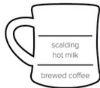
Café Con Leche