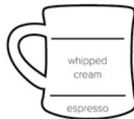
Café Con Panna