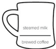
Café Au Lait